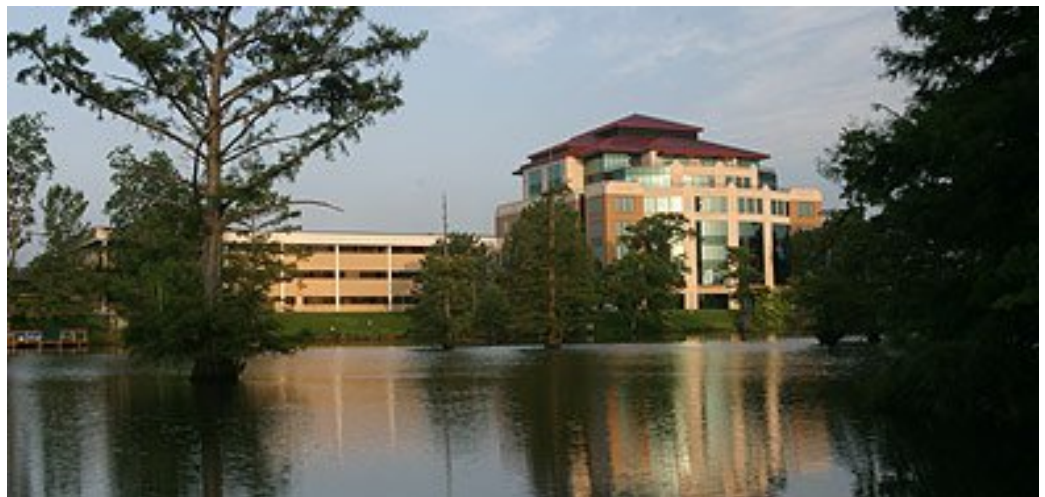
University of Louisiana Monroe Library on Bayou DeSiard

* The State of Louisiana does not typically include Lincoln Parish in the Northeast Louisiana statistical area.