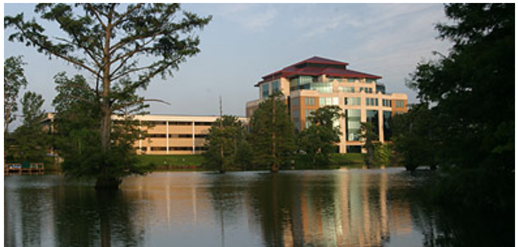
University of Louisiana Monroe Library on Bayou DeSiard

* The State of Louisiana does not typically include Lincoln Parish in the Northeast Louisiana statistical area.